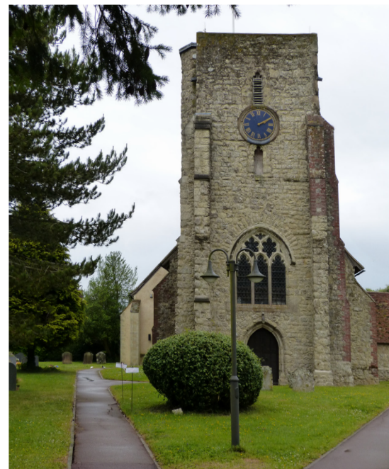
View of church from Church Road with new extension on the left

The church is in a shared benefice with St Peter and St Paul's church at Shadoxhurst about three miles away from Kingsnorth. Both churches are now members of 'Churches Together in Ashford' which is an umbrella group of 26 local churches of different denominations.