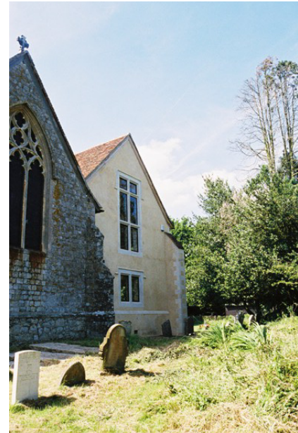
View of extension from the east

Photographs and church plan courtesy of Clague Architects