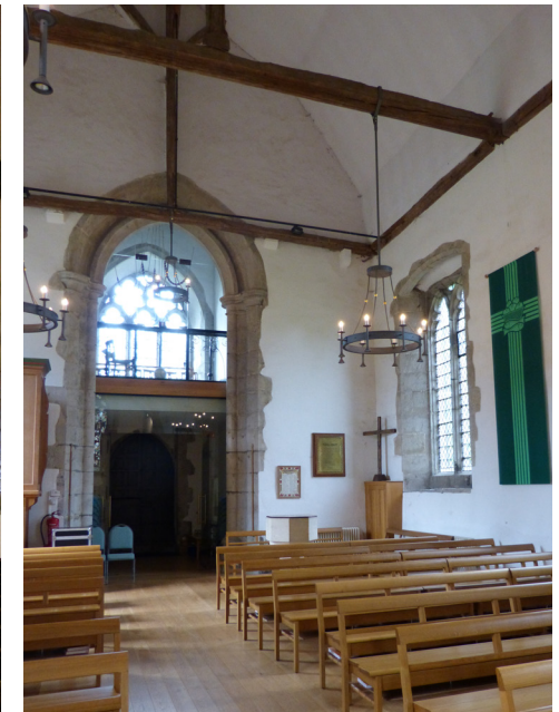
View of nave looking west towards tower before reordering (left) and after (right)