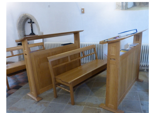
New choir pews & music stands in Chancel