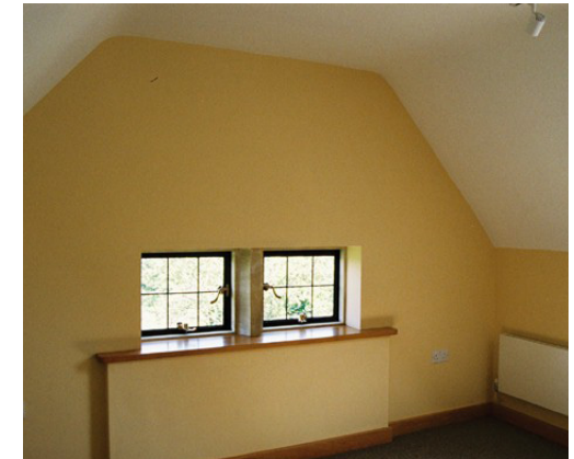
Second floor quiet room