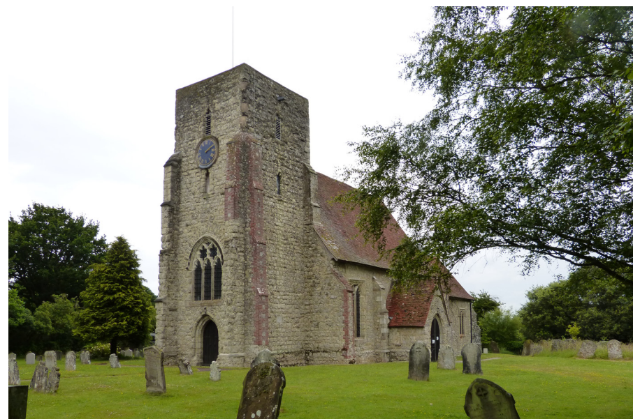
View of church from churchyard