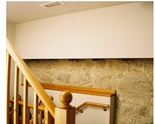
First floor landing showing ragstone wall