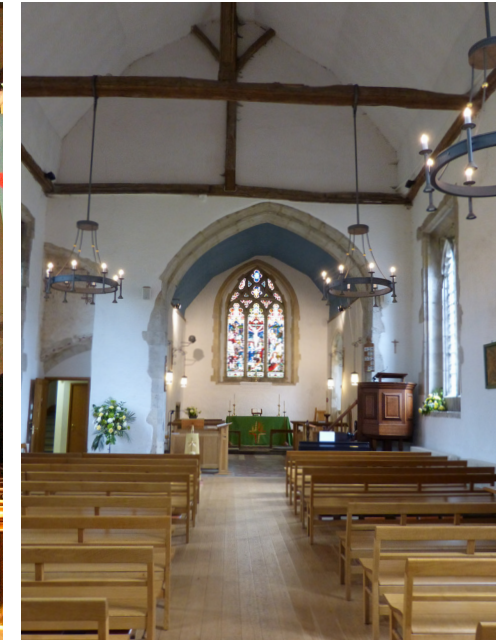
View of nave looking east towards chancel before reordering (left) and after (right)