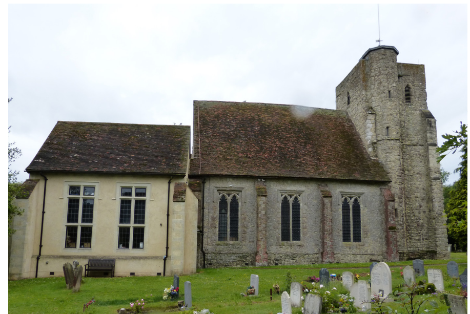
View of church and extension from the north