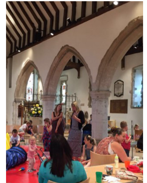
Right: Mums and toddlers club in the nave