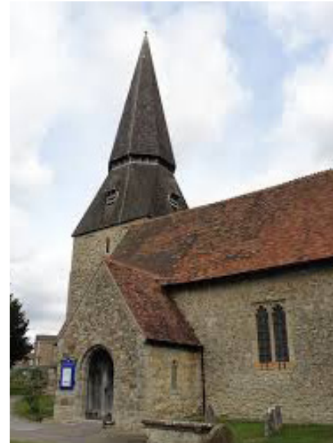
View of church spire and south porch

The church is one of six parish churches within Ashford Town Parish which extends to the surrounding areas of Great Chart, Kennington, Kingsnorth, Sevington and Shadoxhurst as well as central Ashford.