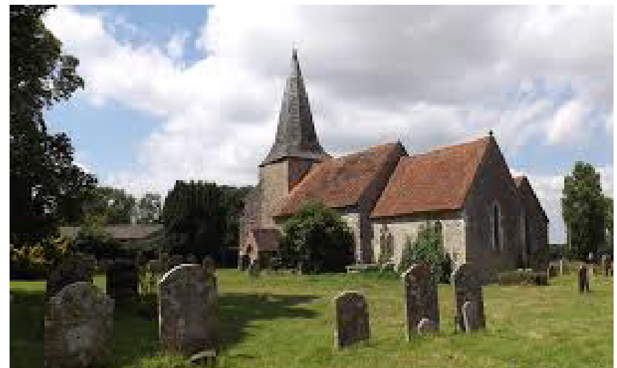
View of church in its setting