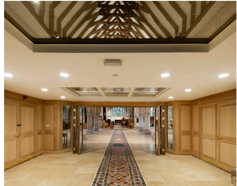
View of welcome area from tower showing Victorian tiled flooring and glazed ceiling with view of roof timbers in the nave

Photographs and church plan courtesy of Lee Evans Partnership except photos of church clubs from parish website