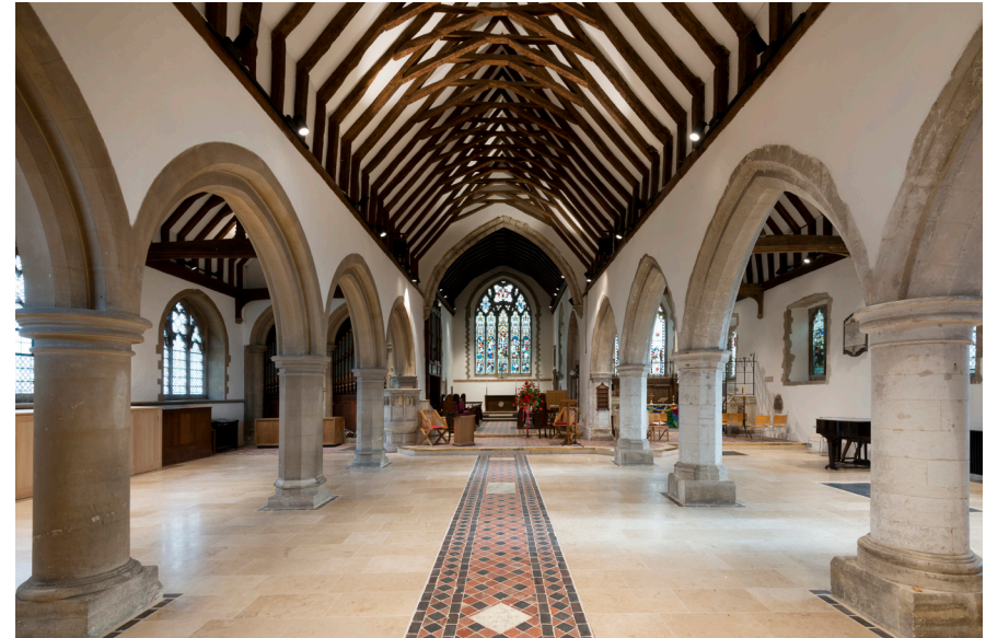
View of nave looking east after reordering (before seating was installed)