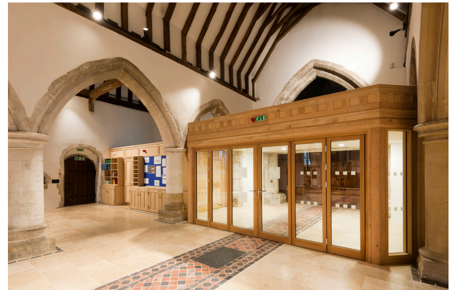
View of nave looking towards welcome area at the west end showing new oak framed glazed screens