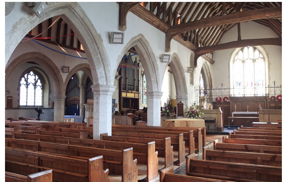
View of nave before reordering