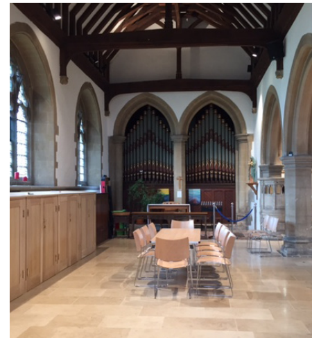
Above: View of north aisle with storage and informal meeting area