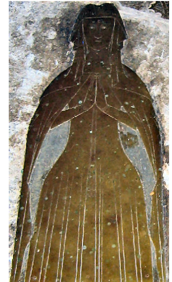
The Clitherow brass