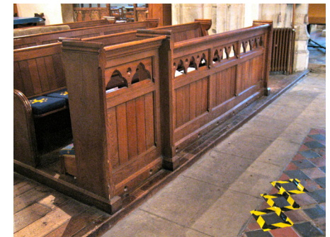
Below left: View towards Molland chapel showing the tiled central aisle with memorial stones and raised pew platforms Below right: Damaged tiles in crossing floor and pews blocking circulation