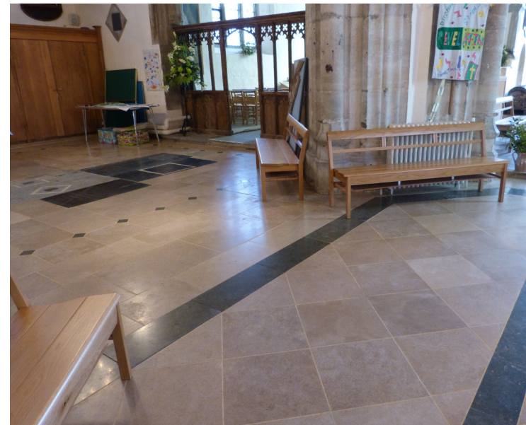
View from crossing towards Molland chapel