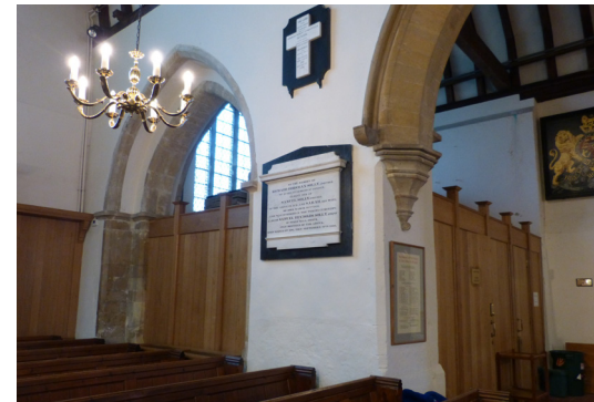
View of tea station & WC at west end of north aisle