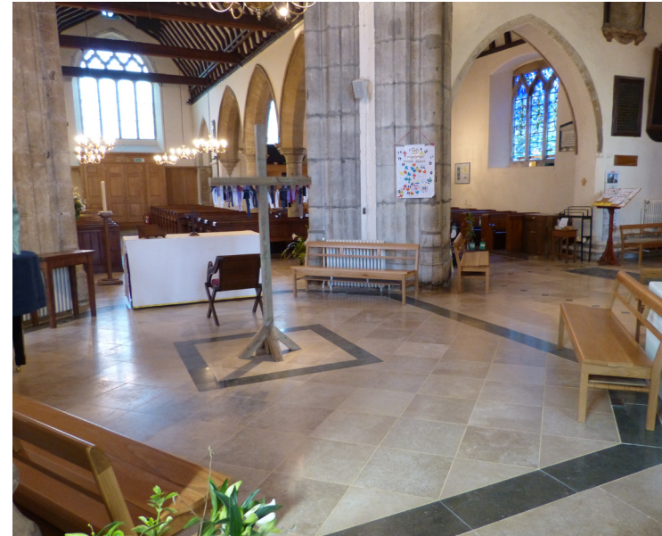
View of crossing looking towards nave and north transept

Architects: Clague Architects Structural Engineer: Adrian Cox Associates Archaeology: Canterbury Archaeological Trust Main Contractor: CWO (Chichester) Ltd (now ceased trading) Stone Flooring: Haysom (Purbeck Stone) Ltd