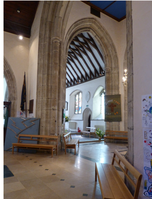
View of crossing and chancel from the north transept