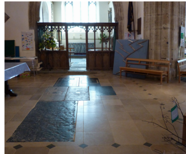
Floor memorials and border in north transept