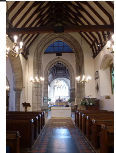
View of nave and crossing with chancel beyond