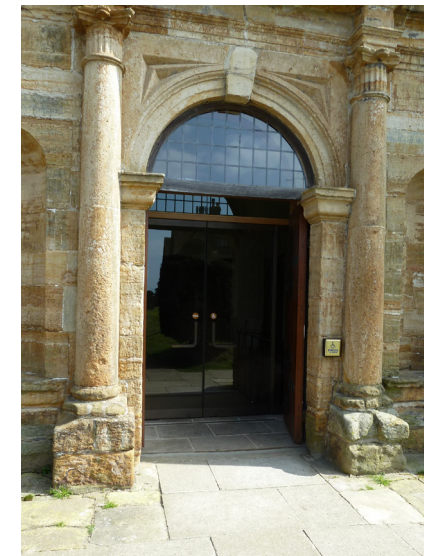
View of new glazed entrance doors in the tower