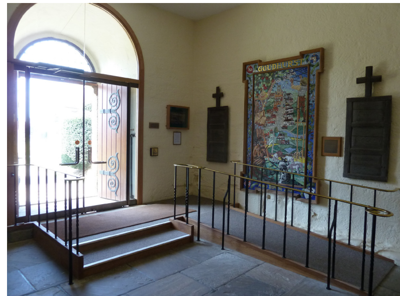
View of tower showing new entrance doors, steps and ramp