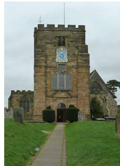
View of west tower approached from the village