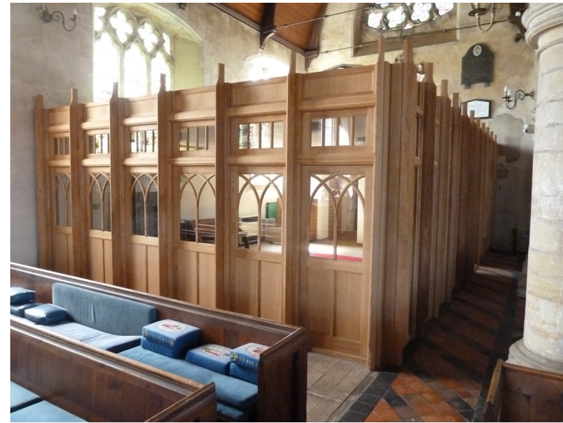
View of children's room

Church plan and photographs courtesy of Clague Architects