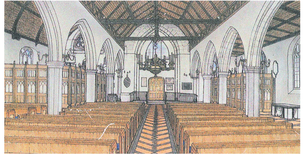
Sketch view of proposed 'pods' prepared by Le Fevre Wood & Royle