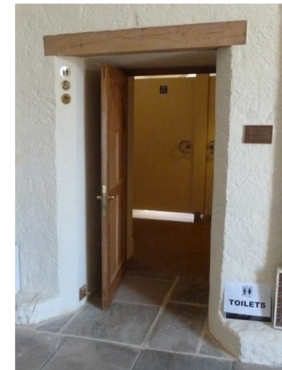
Detail of new doorway in tower to WCs