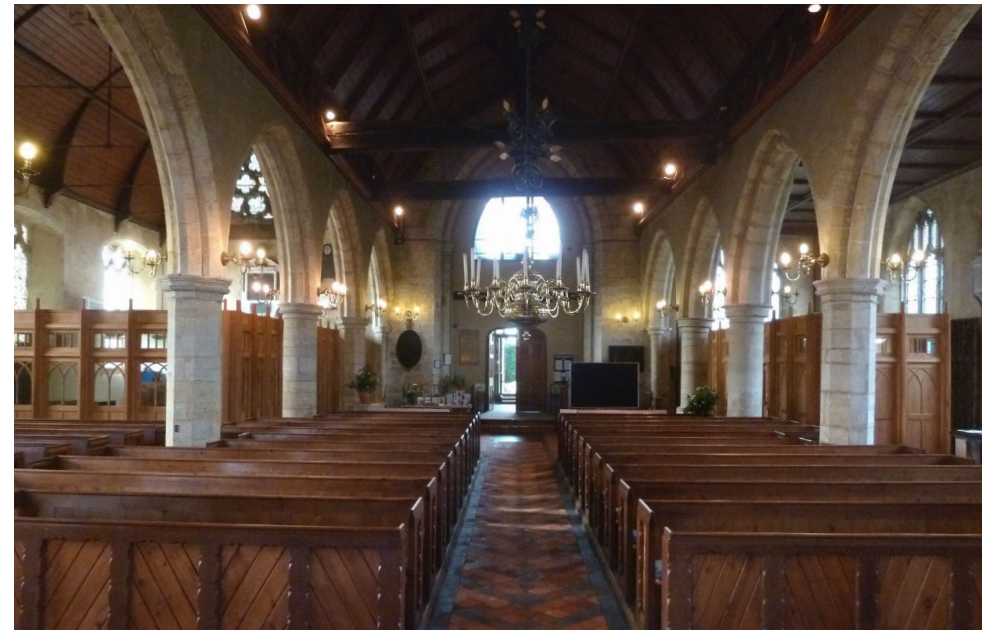
View of nave looking west towards the tower with new 'pods' in south & north aisles