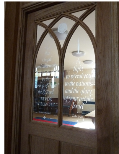
Detail of joinery and etched inscription