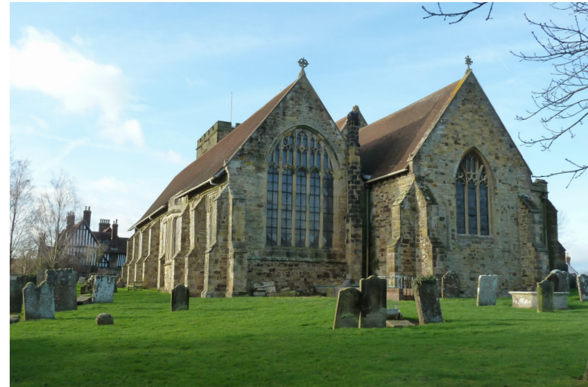
View of church from the east showing the south aisle & chancel

Goudhurst shares its benefice with Christ Church Kilndown which is about three miles away to the south west.