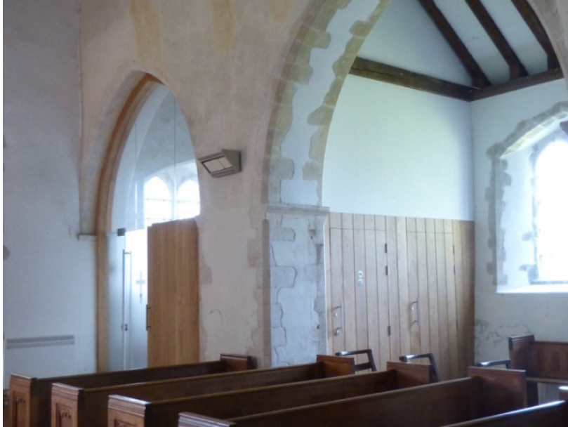
Infill to west end of north aisle with tea station and meeting room on the left and accessible WC on the right

The tea station comprises off-the-peg white kitchen cupboard units containing a stainless steel sink and proprietary hot water dispenser. These are concealed behind a large oak bifold door. The unit has three lower compartments with two wall cupboards above to provide storage for china and cutlery, as well as the water heater and cleaning materials. Recessed ceiling downlights operate automatically when the oak door is opened.