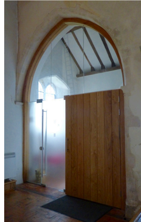
Tea station in closed position