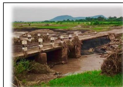
Heavy rain at the start of the year caused flooding. Here the bridge at Mkoka has been swept away in the powerful flow. Fields and young plants were also left covered in mud. Please pray for a good harvest despite these floods, and for food for all this year.