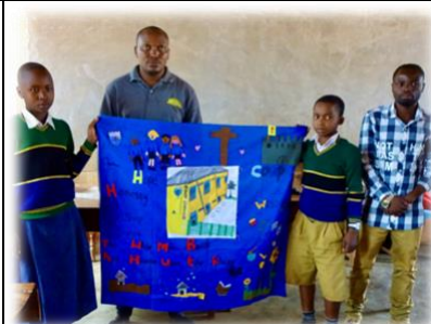
Matongoro Primary receive a banner created by the pupils of Bishop Chavasse School, featuring values of honesty,

Rolling out CCMP across the Diocese is a key part of the Diocesan strategy.