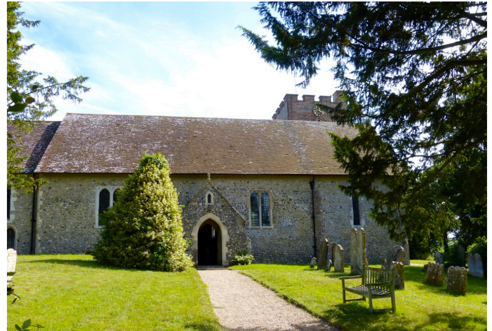
Below: View of church from the north