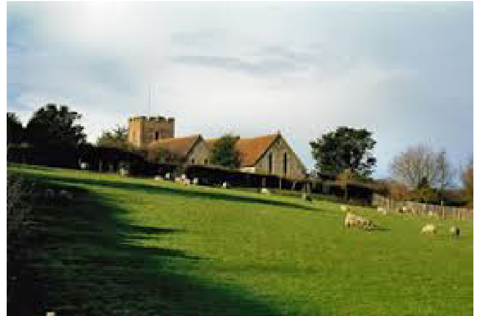
Above: View of church from the east

The church has close links with the primary school which is situated on the opposite side of the road to the east.