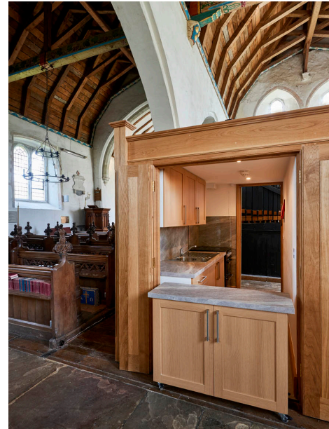
Tea station open with servery in position