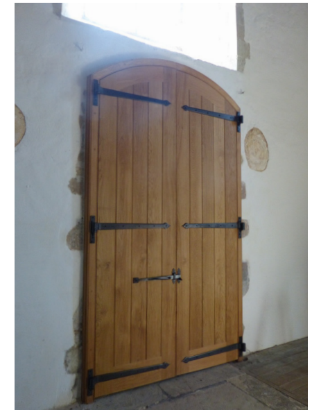
Top: view of new screens in nave arcade next to the organ Left: view of screens in south aisle with new south door Right: new west door