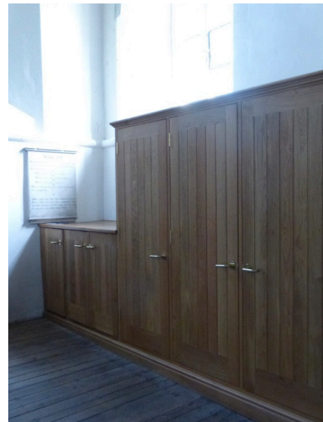
New cupboards in former Lady Chapel