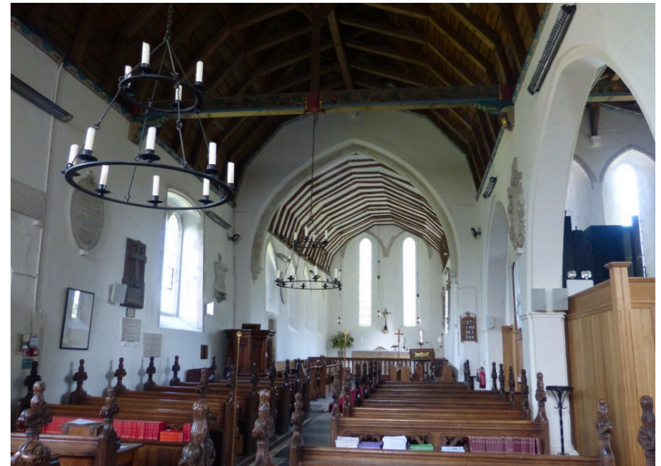
View of nave looking east to chancel