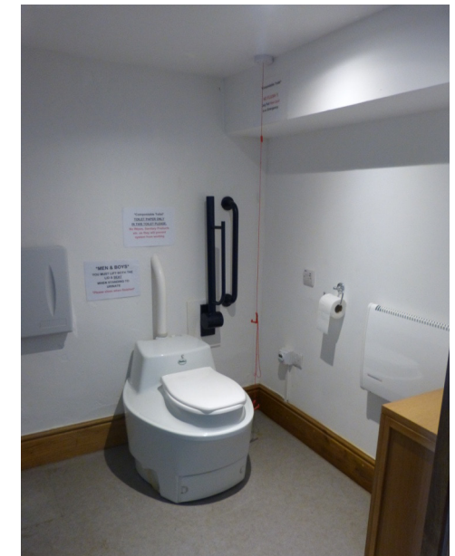
Interior view of biolet