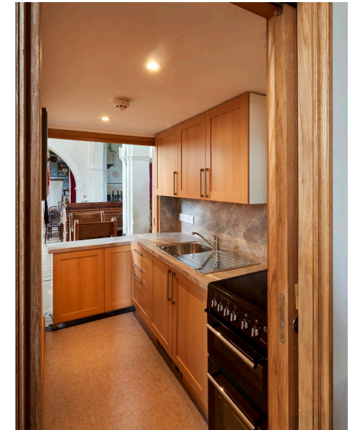
Interior of tea station