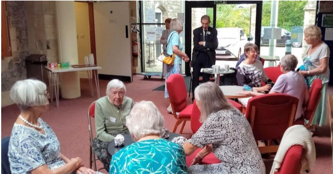
On another hot afternoon in July, Rochester Lay Ministers met at St George's Gravesend