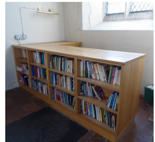
View of tea station and bookshelves