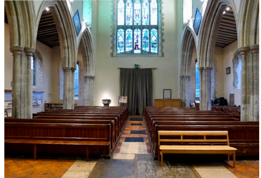
View of nave with pews looking west before reordering