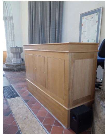
View of audio cabinet