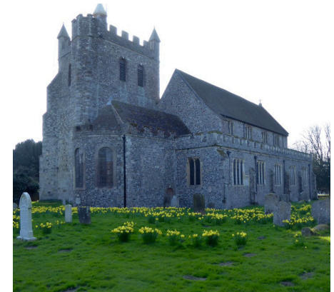
View of chancel & tower from north east