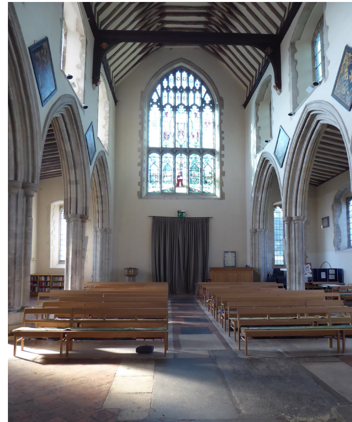
View of nave looking west after reordering

Oak Audio Desk: Architect: Clague Audio specialist: Old Barn Studios