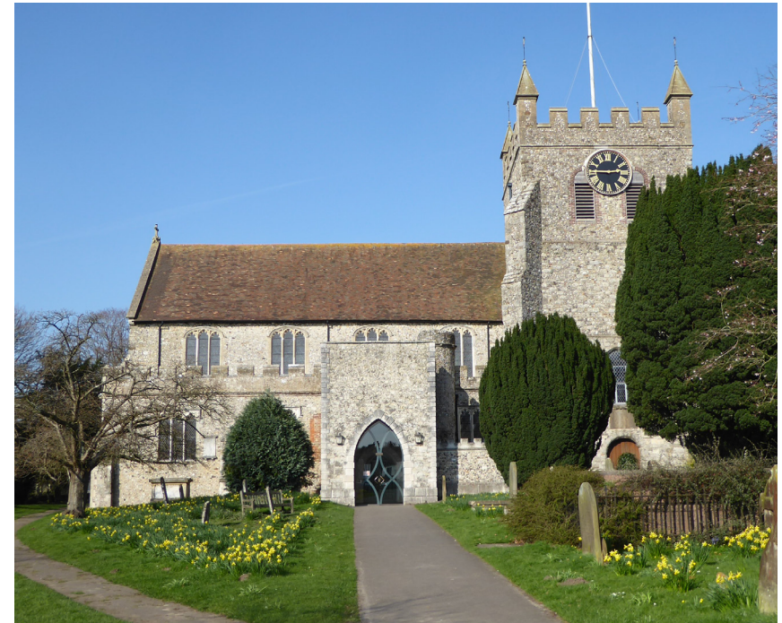
View of church from Church Street

The PCC at Wye have undertaken a continued programme of interventions to improve facilities in the church in order to widen the use of the building by responding to new patterns of worship as well as a variety of community needs, including improved accessibility.