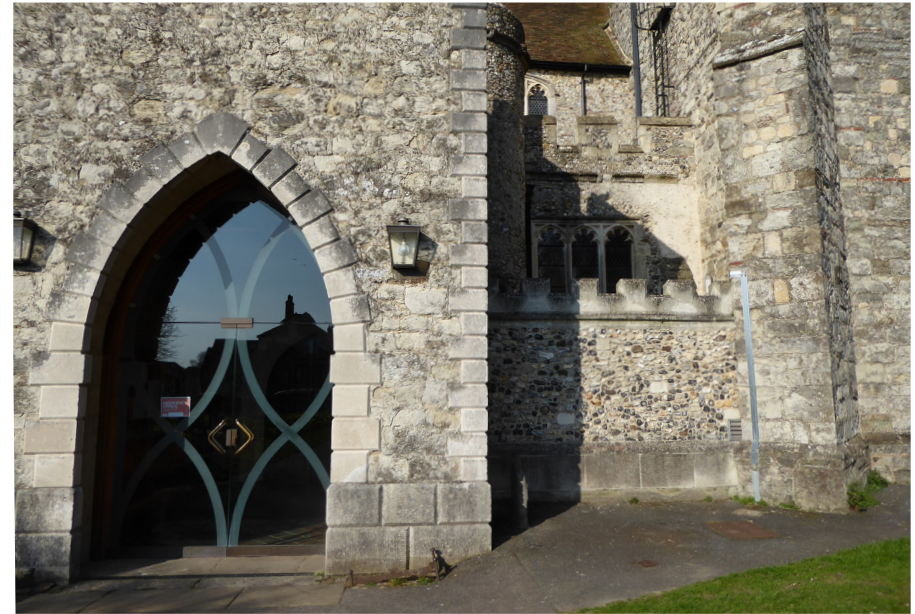
View of glazed porch doors with extension for WCs on the right