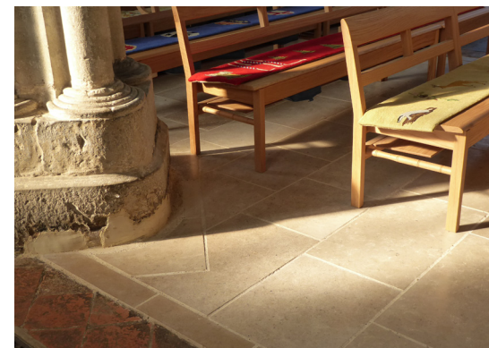
Detail of flooring at base of column