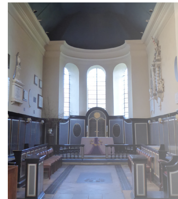
View of church interior showing chancel