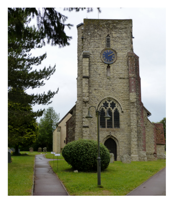
View of church from Church Road with new extension on the left

The church is in a shared benefice with St Peter and St Paul's church at Shadoxhurst about three miles away from Kingsnorth. Both churches are now members of 'Churches Together in Ashford' which is an umbrella group of 26 local churches of different denominations.