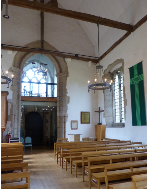
View of nave looking west towards tower before reordering (left) and after (right)