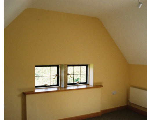
Second floor quiet room

New choir pews & music stands in Chancel