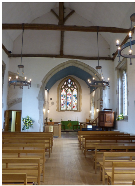
View of nave looking east towards chancel before reordering (left) and after (right)