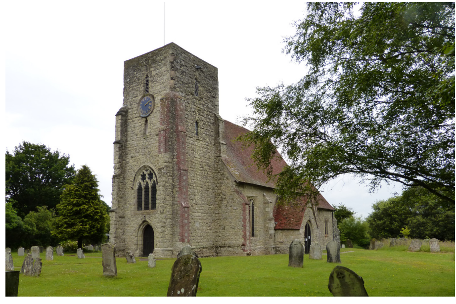
View of church from churchyard