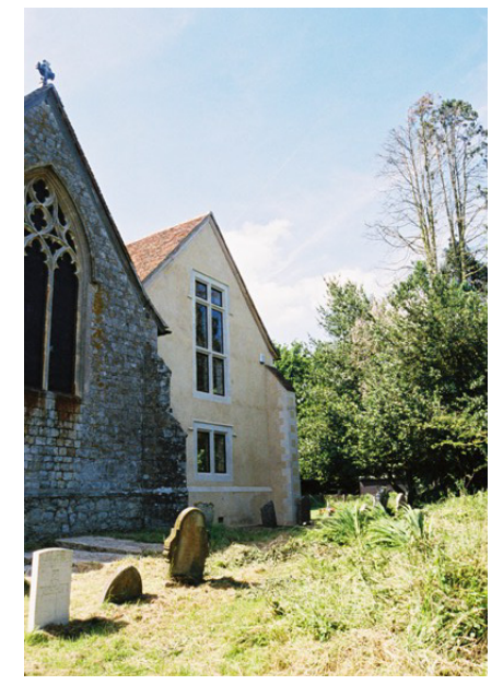
View of extension from the east

Photographs and church plan courtesy of Clague Architects