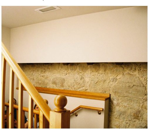
First floor landing showng ragstone wall