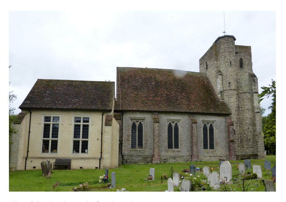
View of church and extension from the north