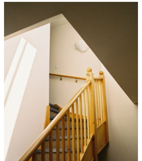
View of staircase up to second floor

New choir pews & music stands in Chancel