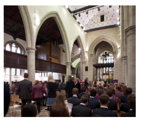
Above: School event in the nave Left: WC showing exposed existing wall stone

Church photographs and plan courtesy of Lee Evans Partnership except for town centre photograph at top of page 1 courtesy of Elaine Wren