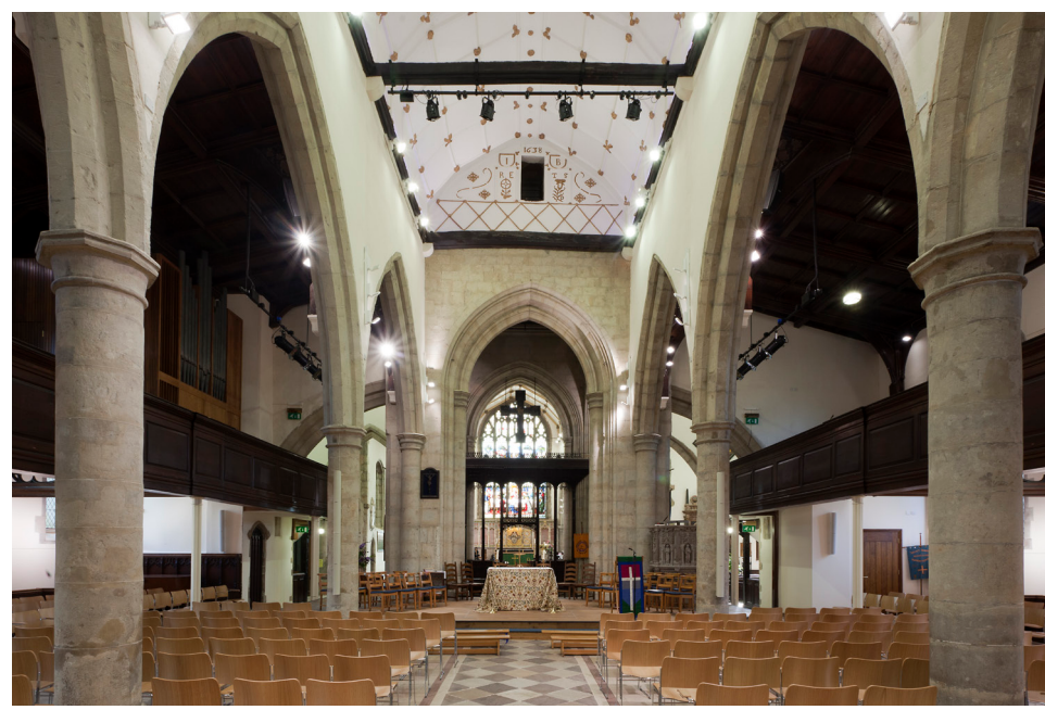
View of nave looking west towards the chancel after reordering