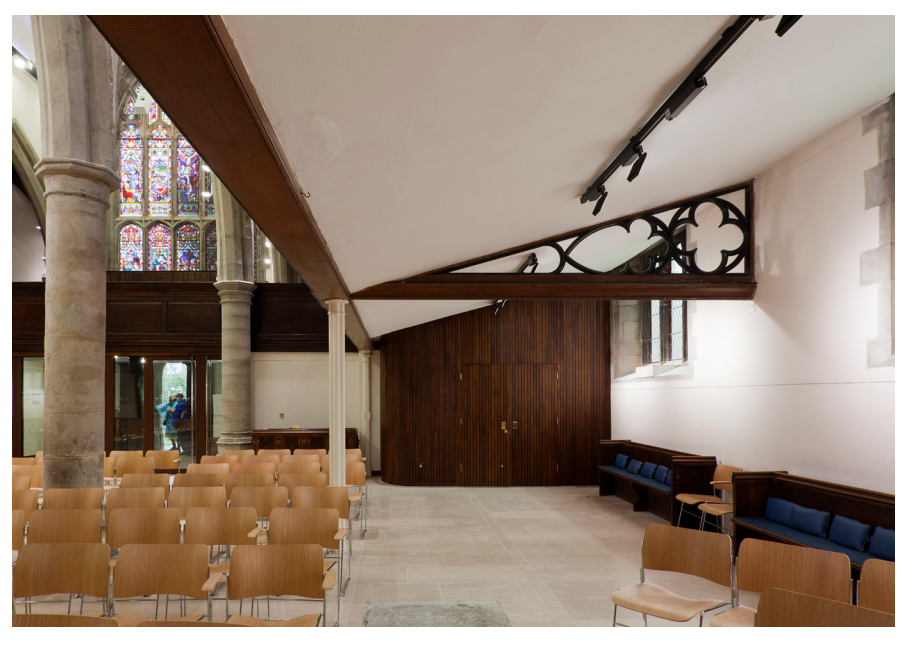
View of 'pod' at the west end of the north aisle