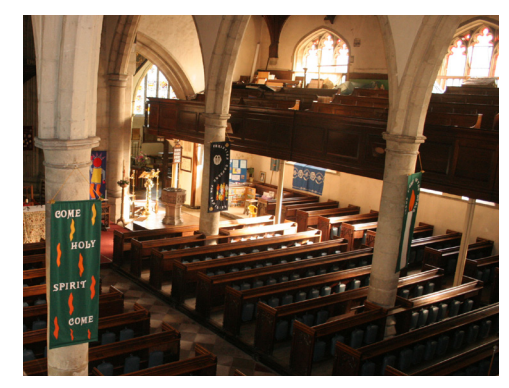
View of nave from galleries: Before reodering