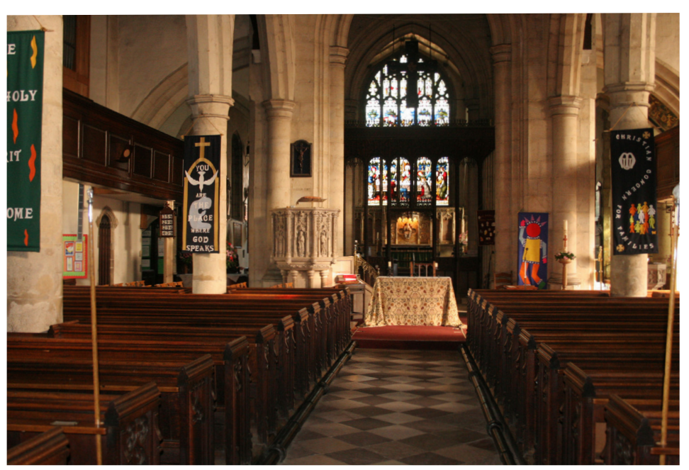
View of nave looking east towards the chancel before reordering