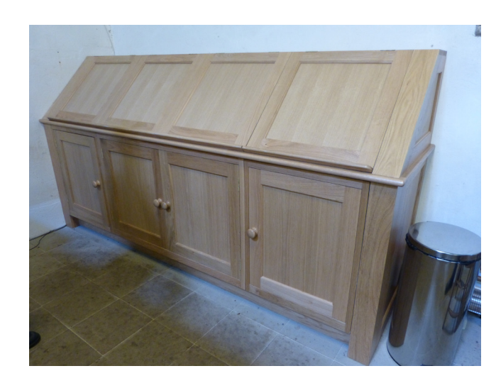
Tea station in closed position

The new tea station and servery have been designed as two separate custom made components, both constructed in oak. The tea station comprises a polished granite counter top incorporating one sink and a hot water dispenser mounted on top of an oak cupboard unit. These are concealed below an angled hinged lid in four sections. The unit has four compartments including pull out drawers to provide storage for cutlery and tea towels as well as the water heater and cleaning materials. The separate mobile servery incorporates a glass covered counter top with further oak storage cupboards for crockery below.