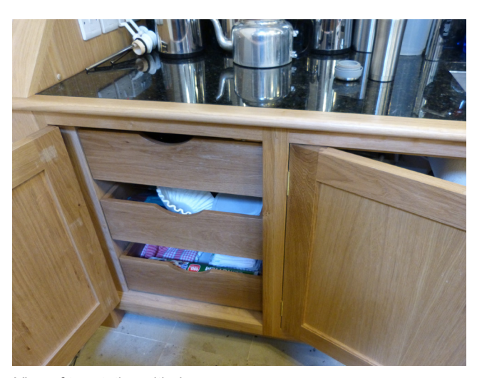
View of tea station with doors open