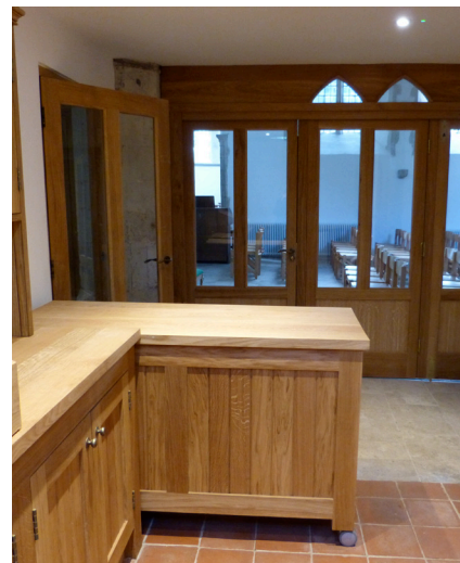
View of tea station and mobile servery looking towards arcade screen

Photographs and church plan courtesy of Clague Architects