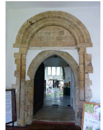
View of west door archway