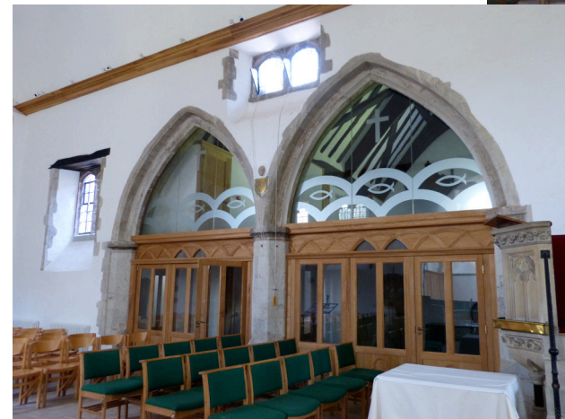
Below: view of church looking towards north aisle and new arcade screens