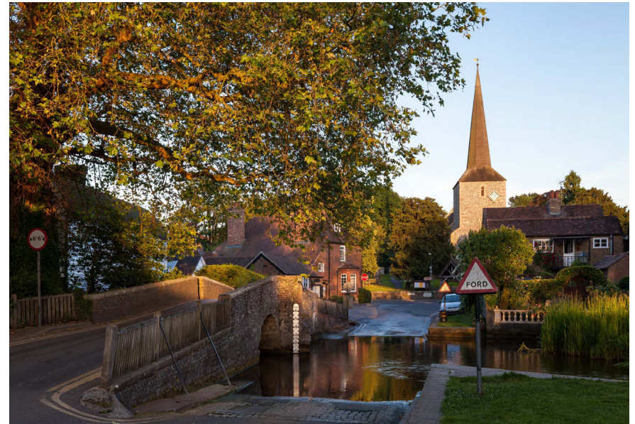
View of church from the bridge over the river Darent

The church is in a shared benefice with Farningham and Lullingstone which are neighbouring villages.