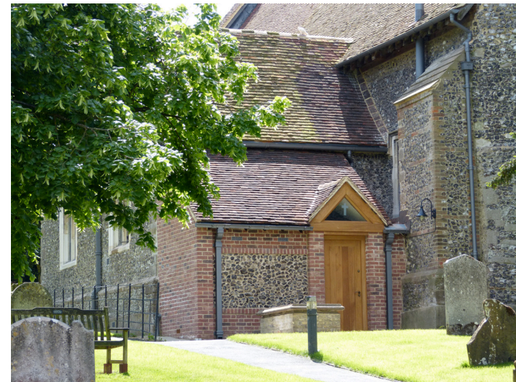
View of new entrance porch adjacent to north aisle