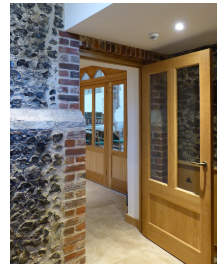
View from new doorway in entrance lobby towards arcade screen