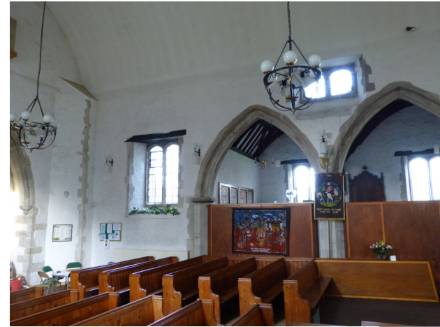
Above: view of church looking towards north aisle before reordering

Architects: Clague Architects Structural Engineer: Adrian Cox Associates Heating Design: John Love Associates Lighting Design: CES Church Lighting Audio-visual Design: Idium Technology Archaeology: Swale Archaeology Main Contractor: Riverside Construction Ltd Stone Flooring: Haysom Purbeck Stone Ltd