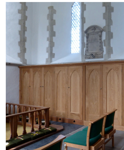
New oak cupboards in south transept