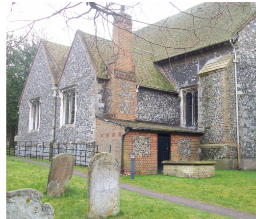
View of church from the north showing the north aisle & boiler room before reordering