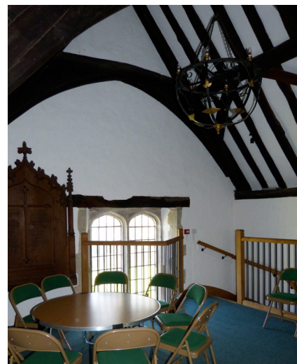
First floor meeting room in north aisle