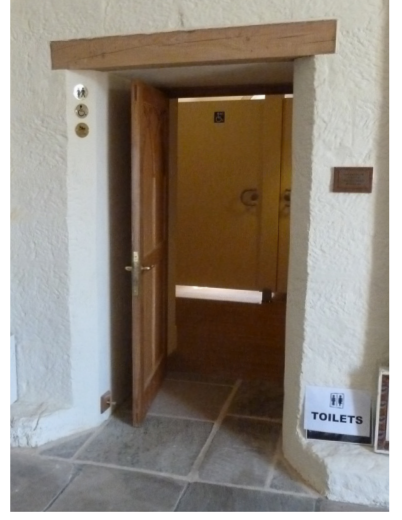
Detail of joinery and etched inscription