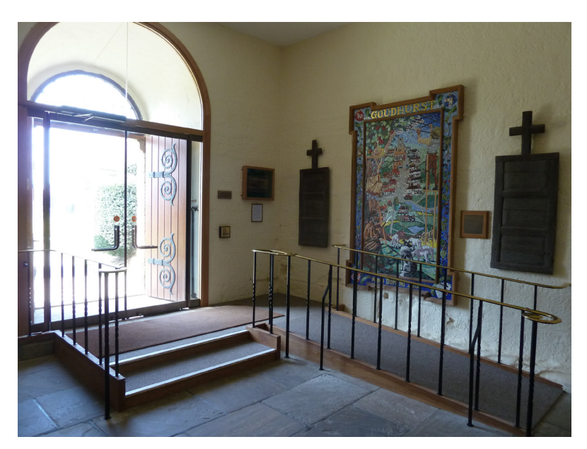
View of tower showing new entrance doors, steps and ramp