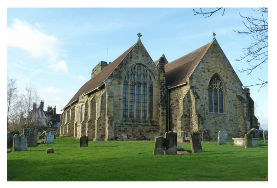
View of church from the east showing the south aisle & chancel

Goudhurst shares its benefice with Christ Church Kilndown which is about three miles away to the south west.