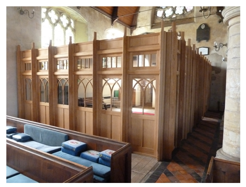
View of children's room

Church plan and photographs courtesy of Clague Architects