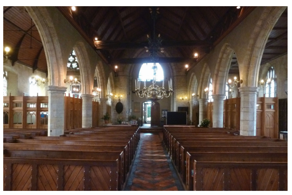
View of nave looking west towards the tower with new 'pods' in south & north aisles