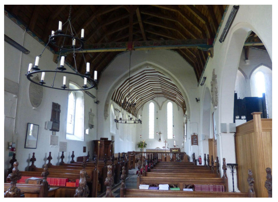
View of nave looking east to chancel