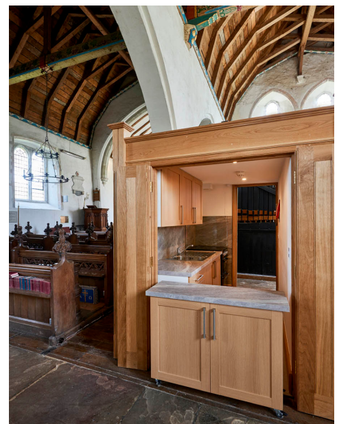
Tea station open with servery in position