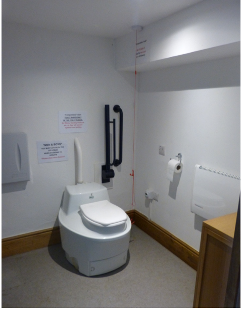
Interior view of biolet

Church plan courtesy of Lee Evans LLP; photographs by Elaine Wren except where noted otherwise