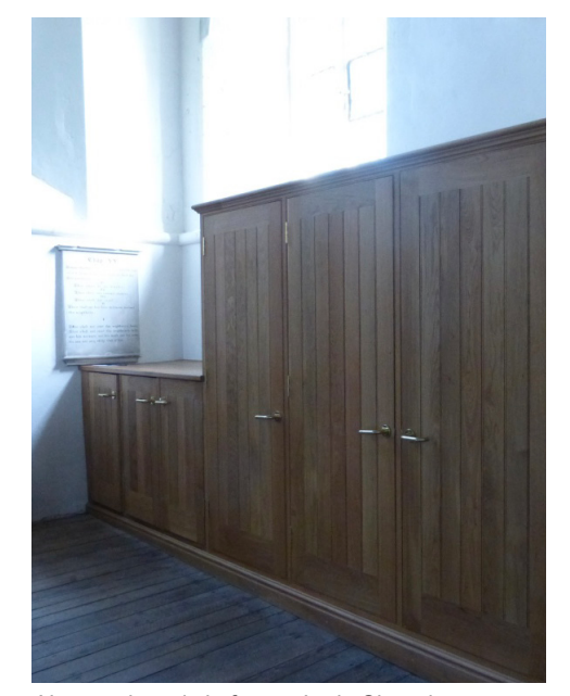
New cupboards in former Lady Chapel