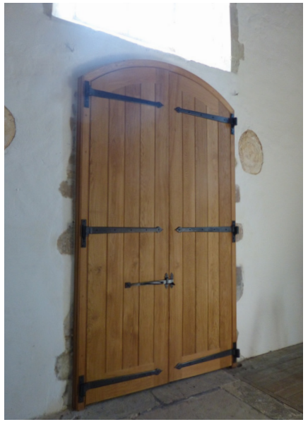
Top: view of new screens in nave arcade next to the organ Left: view of screens in south aisle with new south door