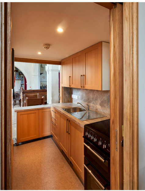
Interior of tea station