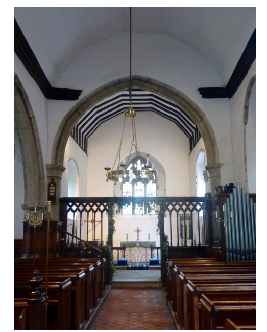
Above: View of chancel with rood screen