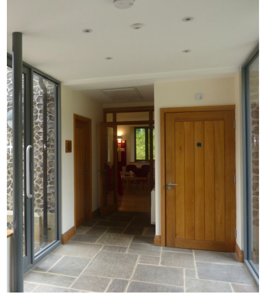
View inside link corridor looking towards the WCs and Cloisters Room