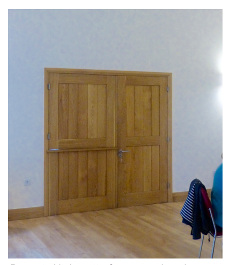
Doors to kitchenette & servery closed

Parish contact details Tel: 01732 822 494 e-mail: rev.stmarystansted@gmail.com