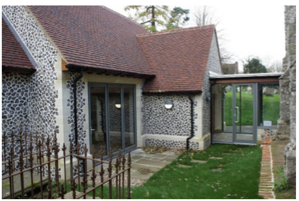
View of extension from the east showing the fully glazed link to the tower

Archaeologist: Archaeology South East Building Contractor: Allen Construction (Kent) Ltd Audio Visual System: Creative Audio-Visual Solutions Ltd