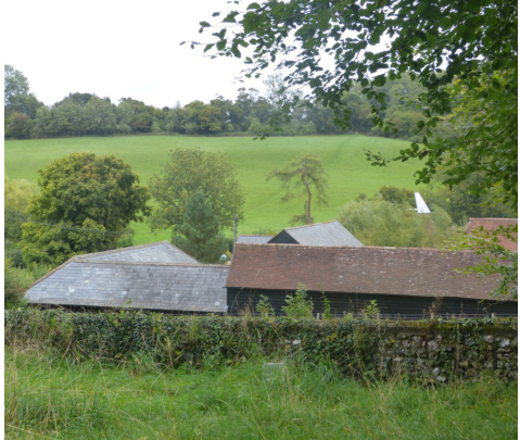
Above: View of rural setting to the north of the churchvard