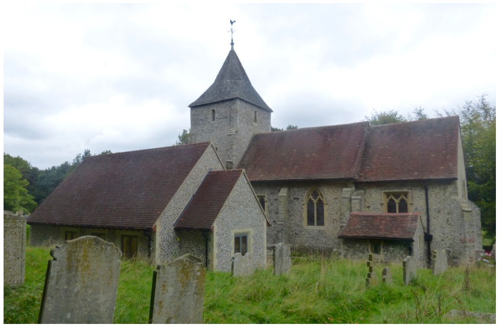
View of Cloisters extension from the south east