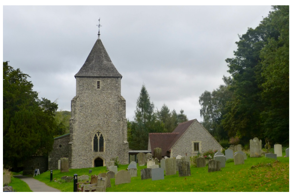
Above: View of church from the west with the extension to the right of the tower

All three parishes have limited community facilities, and although there is a village hall at Vigo, the primary school at Stansted was recently closed down.