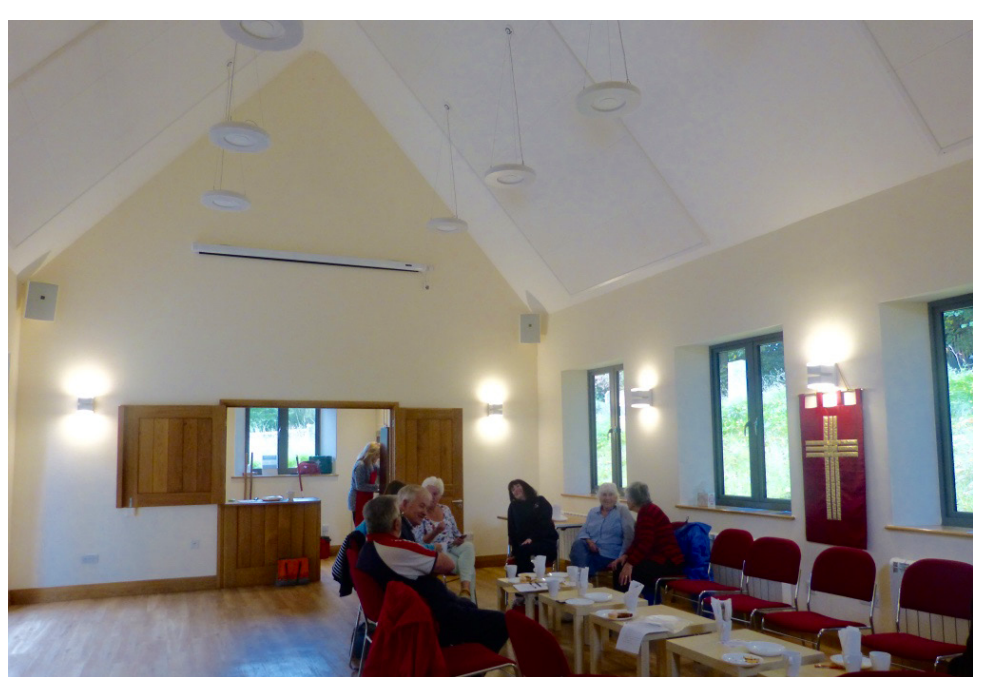
View of Cloisters Meeting Room

Involve the DAC and church buildings specialists at the earliest possible time, and keep them involved throughout, to avoid setbacks.