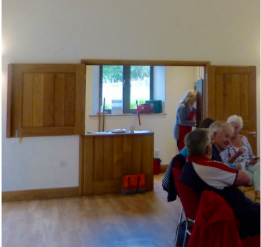
Doors to kitchenette & servery in open position

Parish contact details Tel: 01732 822 494 e-mail: rev.stmarystansted@gmail.com