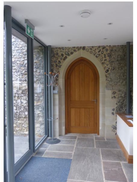
View inside link corridor looking towards the new tower door