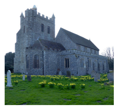
View of chancel & tower from north east