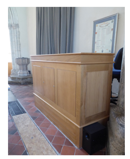
View of audio cabinet