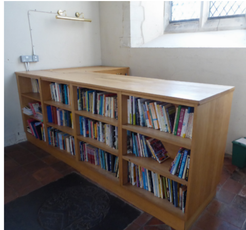
View of tea station and bookshelves