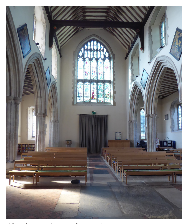
View of nave looking west after reordering