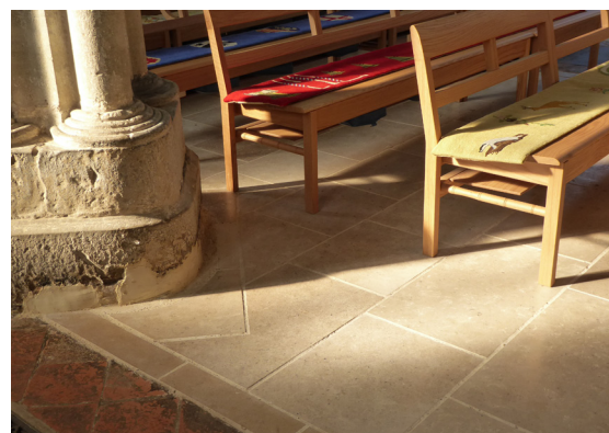
Detail of flooring at base of column