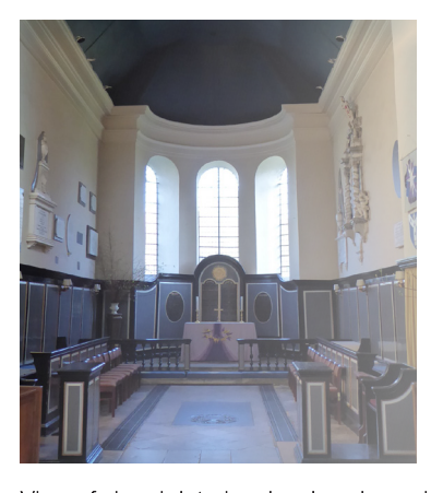
View of church interior showing chancel