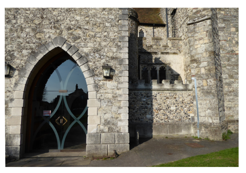
View of glazed porch doors with extension for WCs on the right

Photographs on page 2 and church plan courtesy of Rutherord Architects Photographs on pages 1, 3 & 4 courtesy of Elaine Wren