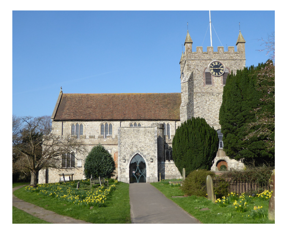
View of church from Church Street

The PCC at Wye have undertaken a continued programme of interventions to improve facilities in the church in order to widen the use of the building by responding to new patterns of worship as well as a variety of community needs, including improved accessibility.