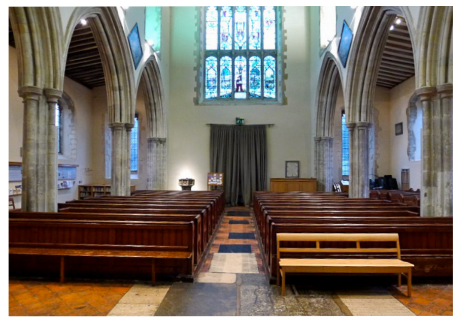
View of nave with pews looking west before reordering